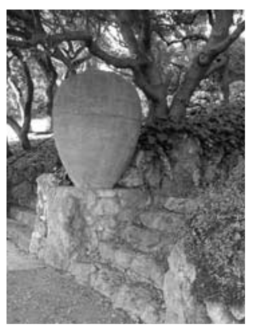
A stone urn marks the bottom of Indian Trail which leads upward to Great Stoneface Park.

Many of the pathways join parks and make them more accessible. Our interests require treasured open spaces to be kept usable and beautiful. Measures S & W can do that.