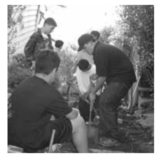
Berkeley Boy Scouts Troop 19 at work on Twin Path.