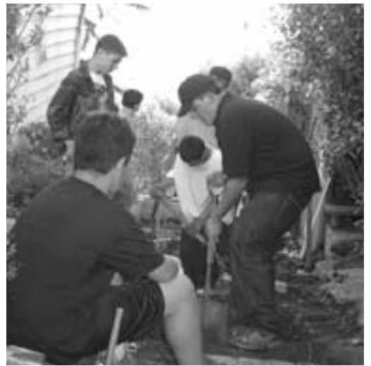
Berkeley Boy Scouts Troop 19 at work on Twin Path.