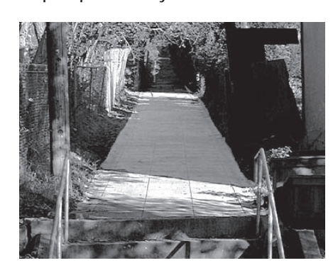
Easter Way - repairs of cracks and tilting improve walking