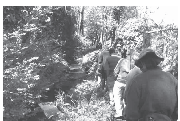
(continued on back page) Path wanderers explore Codornices Creek, in Albany Village.

A number of exciting flatland trail projects have recently been completed or are currently under construction or being planned. The most visible change is the beautiful