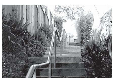
Martinez Path - new handrails and repaired steps improve safety