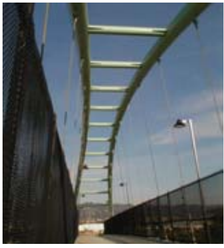
Before the bridge opened, pedestrians and bikers had to go under I-80 to visit the Berkeley Marina.

This new bridge is merely the first piece of a network of trails to appear