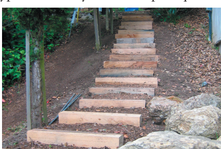
Middle Glendale Path

Although our labor is donated, a typical stairway of 100 steps requires