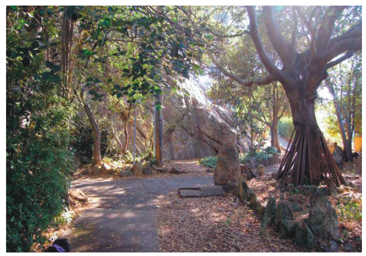
Indian Rock Path

Berkeley Path Wanderers Association 1442A Walnut Street, #269 Berkeley, CA 94709