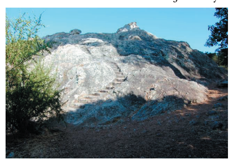
The Steps to Indian Rock

Whichever route you choose, finish your walk by climbing the steps to the top of Indian Rock and settle in for the gorgeous 180 degree vista of San Francisco and Marin. Good timing should get you at the top in time for a fabulous sunset. If it's late January