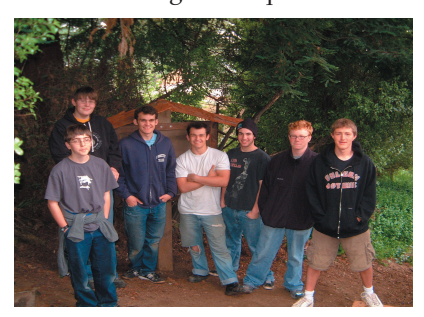
Some Scouts from Troop 19

Since 1998 when a portion of Keeler Path was completed, the members of Troop 19 have improved 11 different paths over the course of 16 Eagle projects. In addition to earning the required minimum of 21 merit badges and holding a leadership position in the troop, the Eagle candidate's toughest requirement is