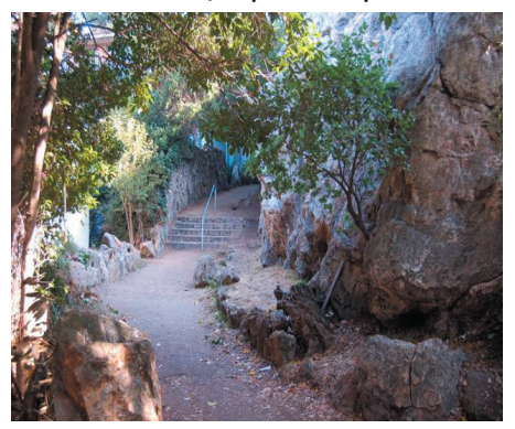
Indian Rock Path

Any time is great for walking this path. In fact, neighborhood residents can be seen with their shopping bags, kids and dogs going up and down at all hours. But, if you really want to