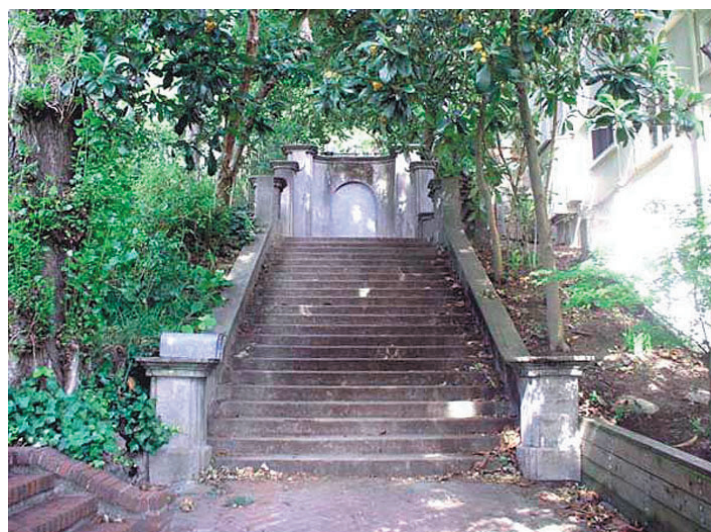
Orchard Lane on Panoramic Hill

Berkeley Path Wanderers Association 1442A Walnut Street, #269 Berkeley, CA 94709