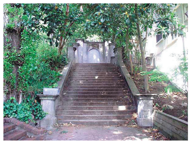
Orchard Lane - Panoramic Hill Area

Berkeley Path Wanderers Association 1442A Walnut Street, #269 Berkeley, CA 94709