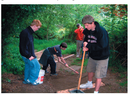
Scouts at Work

need for path building. It's a perfect fit. The entire design and building process normally requires six months