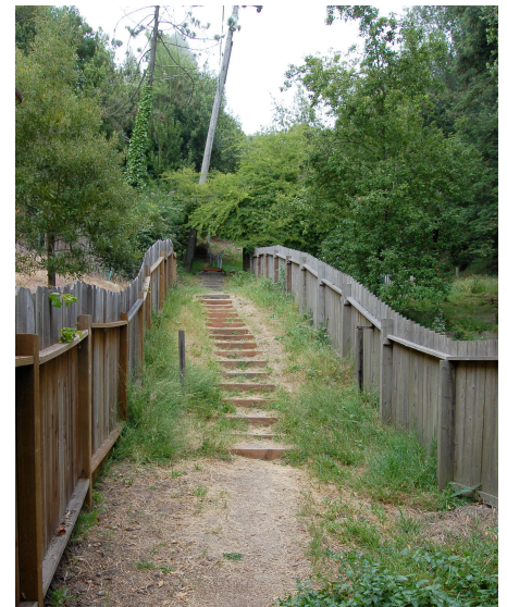
Lower Section of Glendale Path