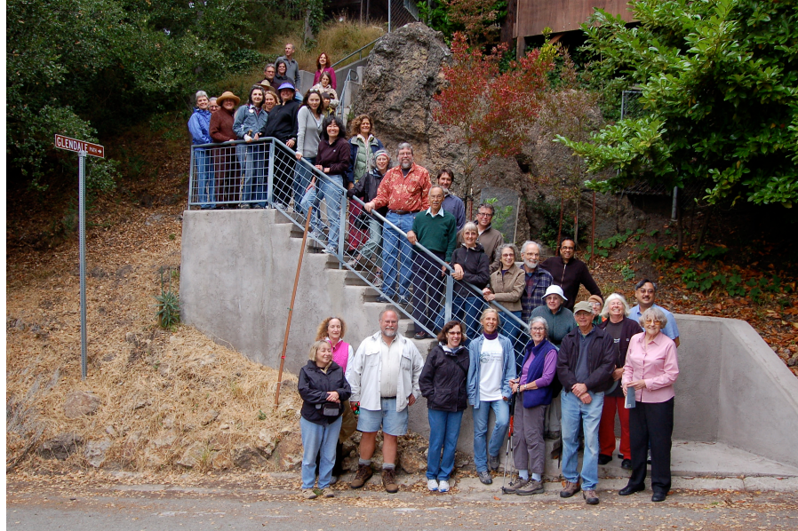
Path Wanderers, city officials, and neighbors turned out on August 5 to dedicate the three-part Glendale Path

The Berkeley Path Wanderers Association is a volunteer group of community members who have come together to increase public awareness of the City of Berkeley's pathways. Our activities include guided path walks, the mapping of Berkeley's path network, the building of paths that are proposed, and the restoration of those that need maintenance.