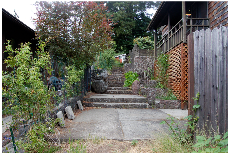
Steps at the top of Glendale Path

The Berkeley Path Wanderers Association is a volunteer group of community members who have come together to increase public awareness of the City of Berkeley's pathways. Our activities include guided path walks, the mapping of Berkeley's path network, the building of paths that are proposed, and the restoration of those that need maintenance.