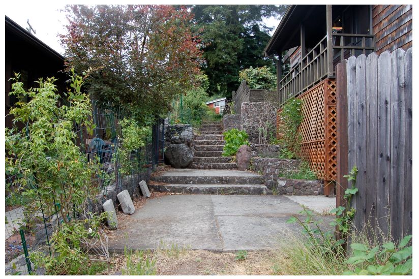
Steps at the top of Glendale Path

The Berkeley Path Wanderers Association is a volunteer group of community members who have come together to increase public awareness of the City of Berkeley's pathways. Our activities include guided path walks, the mapping of Berkeley's path network, the building of paths that are proposed, and the restoration of those that need maintenance.