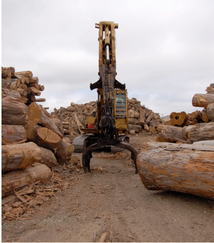
New Life Millworks' Log Grapppler