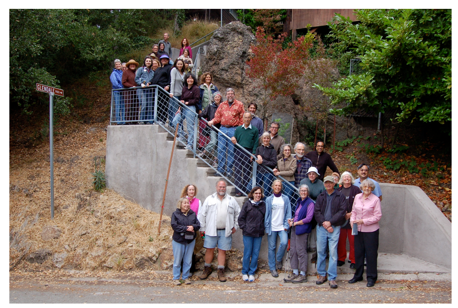
Path Wanderers, city officials, and neighbors turned out on August 5 to dedicate the three-part Glendale Path

The Berkeley Path Wanderers Association is a volunteer group of community members who have come together to increase public awareness of the City of Berkeley's pathways. Our activities include guided path walks, the mapping of Berkeley's path network, the building of paths that are proposed, and the restoration of those that need maintenance.