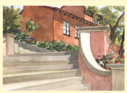
This set of four note cards with envelopes features Rose Walk (above) and three other paths. The cards are gorgeous reproductions of watercolors by Karen Kemp. The set is only $6.50 and makes a wonderful gift.