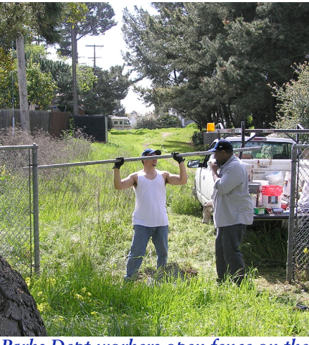
Parks Dept workers open fence on the Santa Fe Right of Way at Lincoln St.

The Santa Fe Right of Way, the old rail corridor that in Berkeley runs north-south, west of Sacramento Street, is now open from University Avenue all the way to McDonald and San Pablo Avenues in Richmond. The