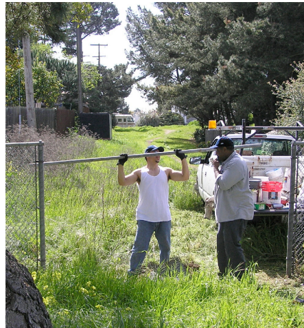
Parks Dept workers open fence on the Santa Fe Right of Way at Lincoln St.

The Santa Fe Right of Way, the old rail corridor that in Berkeley runs north-south, west of Sacramento Street, is now open from University Avenue all the way to McDonald and San Pablo Avenues in Richmond. The