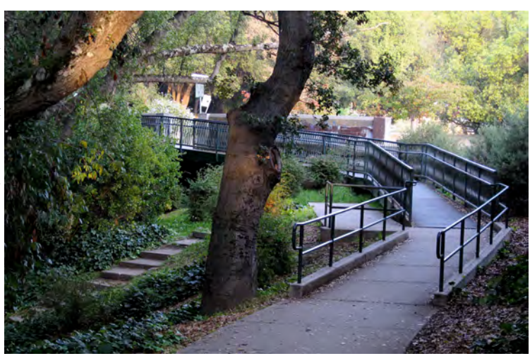
All three walks should leave or re-enter Live Oak Park on this ramp

bridge, Chester, and more. Some of the steps on these paths are uneven and steep, but the pace will be moderate.