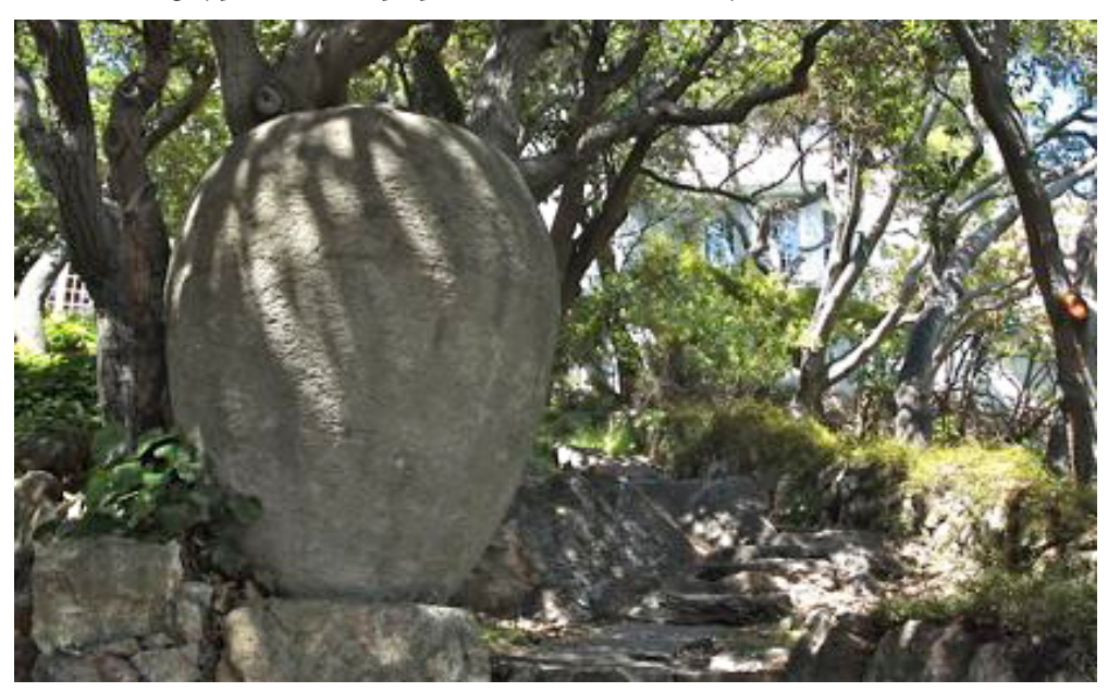
This giant urn marks the bottom of Indian Trail (See page 2).

The Berkeley Path Wanderers Association, an affiliate of Berkeley Partners for Parks, is a volunteer group of community members who have come together to increase public awareness of the City of Berkeley's pathways. Our activities include guided path walks, the mapping of Berkeley's path network, the building of paths that are proposed, and the restoration of those that need maintenance.