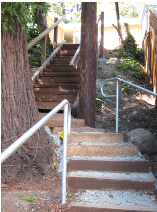
Newly completed La Loma Path will be dedicated with a ribbon-cutting ceremony as part of this year's Path-a-Thon