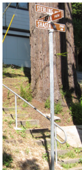
New handrail at the bottom of Shasta Path