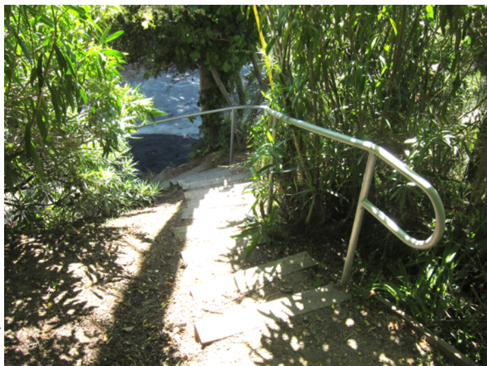
BPWA installed this handrail on Middle Glendale Path