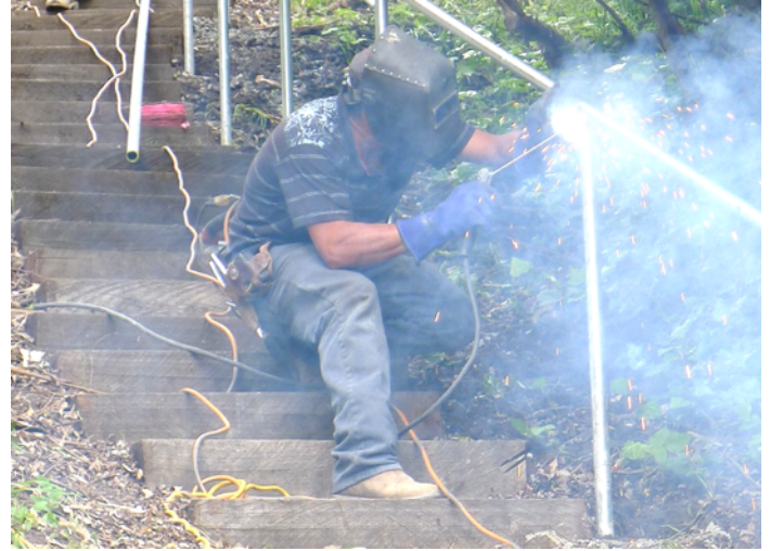
Installing the handrails on La Loma Path