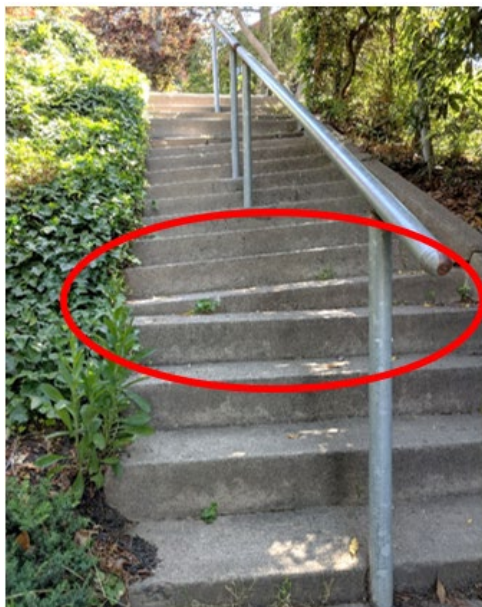
Uneven/ broken steps on concrete path