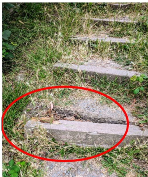
Broken step on landscaped path