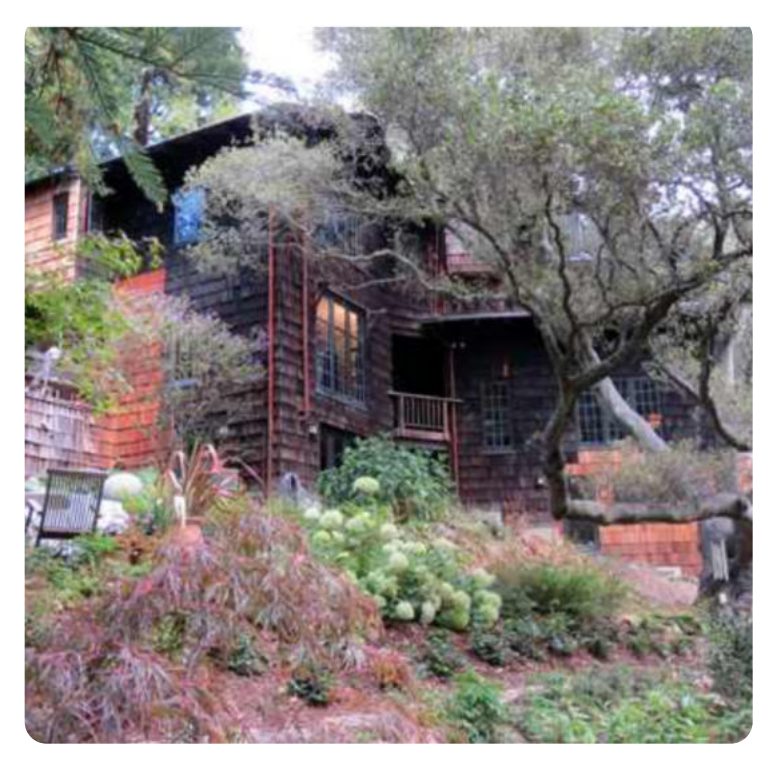
Photographer Dorothea Lange's former home on Euclid Street.