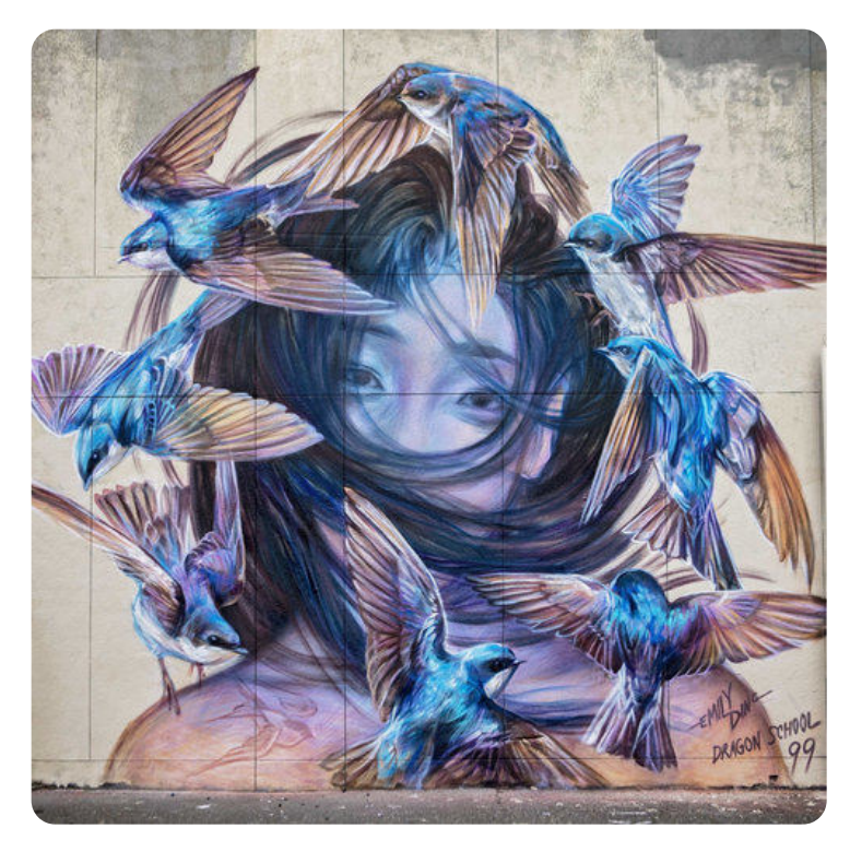
Mural on Dragon School in Oakland's Uptown neighborhood.