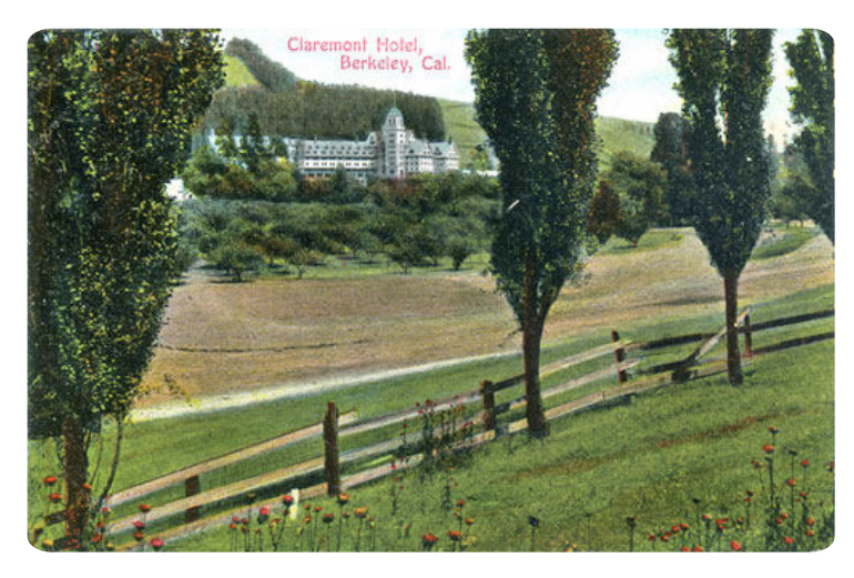
The Claremont Hotel amid the Garber and Palache fruit orchards.