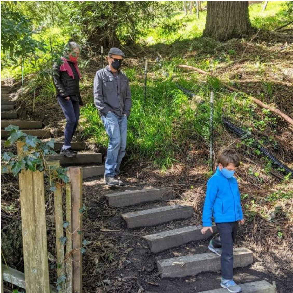
A family enjoys wandering on the new section of Wildcat Path, between Park Hills and Tilden Park.