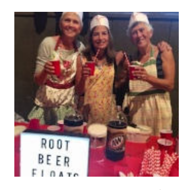
Did you forget to pay your $5 dues for 2018? We do not want to lose you. Please renew today.

We're compiling the information you gathered to give the city a complete list of missing signs, to send our path