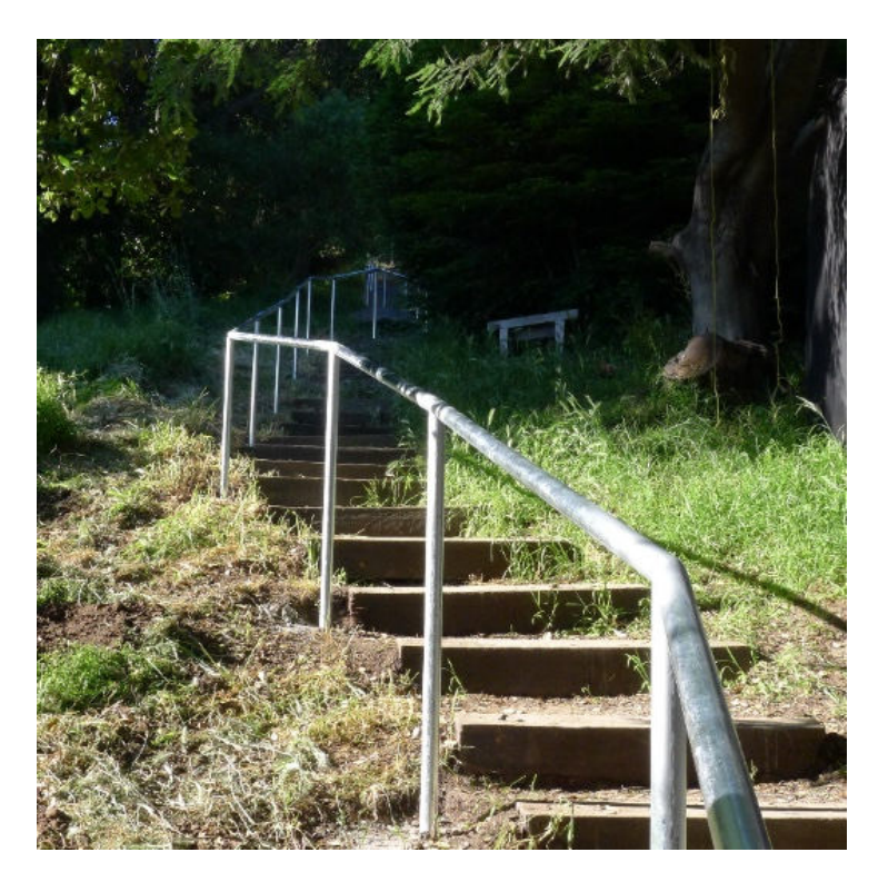
The 300' of handrails on Upper Covert Path is the longest run in the handrail corridor.