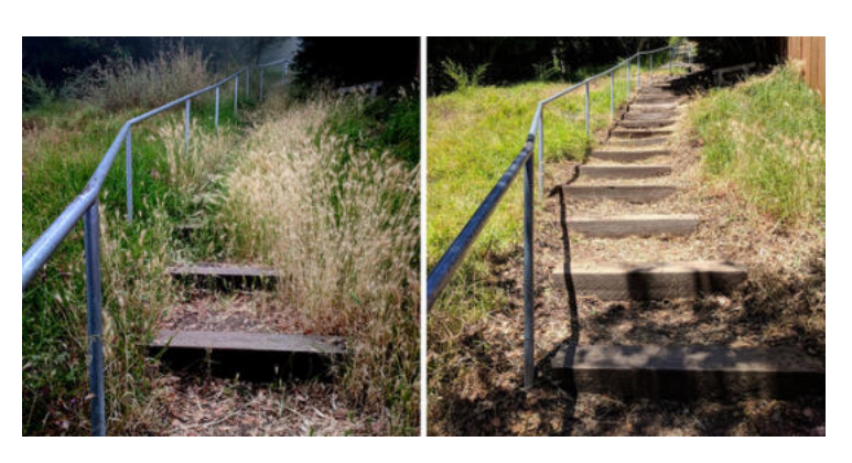
Our volunteers tackled the weeds on Upper Covert Path, part of our new handrail corridor, just in time for our August 18 ribbon-cutting ceremony. (See top article.)