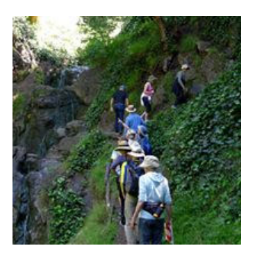
Your generosity enables us to build more paths and continue to offer our path-oriented events. <u>Donate now.</u>