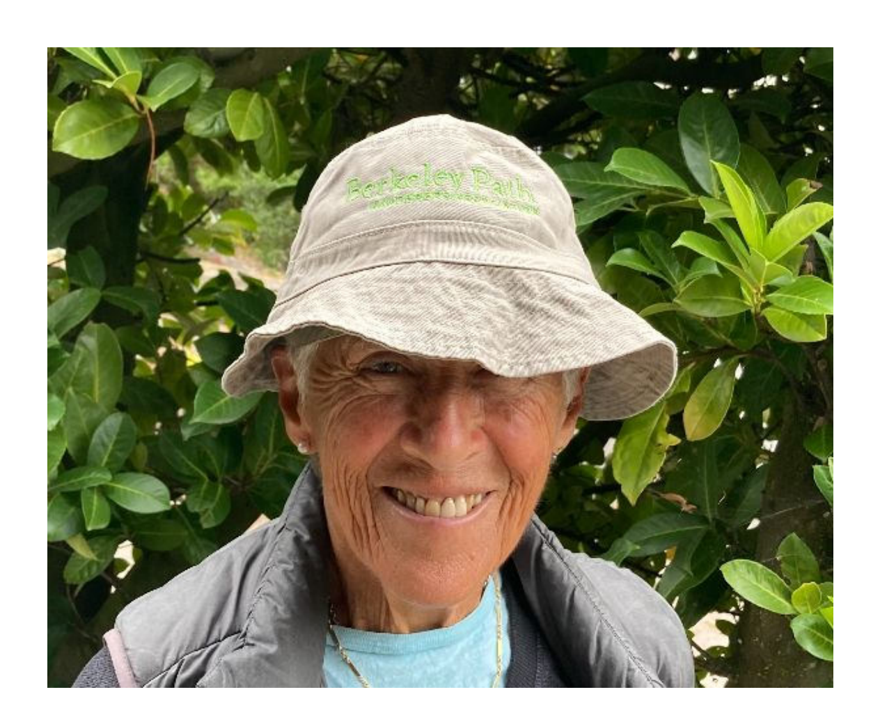
VISIT US AT SOLANO STROLL