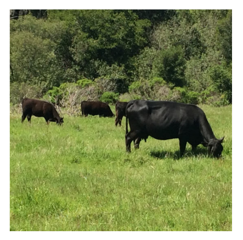
In addition to these domesticated grazers, we may spot a coyote or two on this walk.