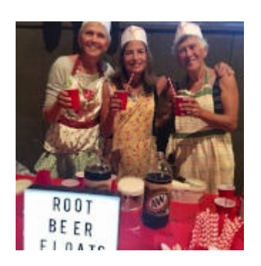
Did you forget to pay your $5 dues for 2018? We do not