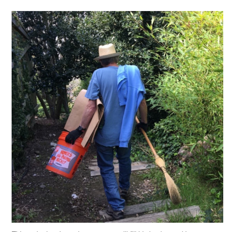
This path-cleaning volunteer soon will fill his bucket and large paper bag with the weeds and debris he clears from these timber steps.