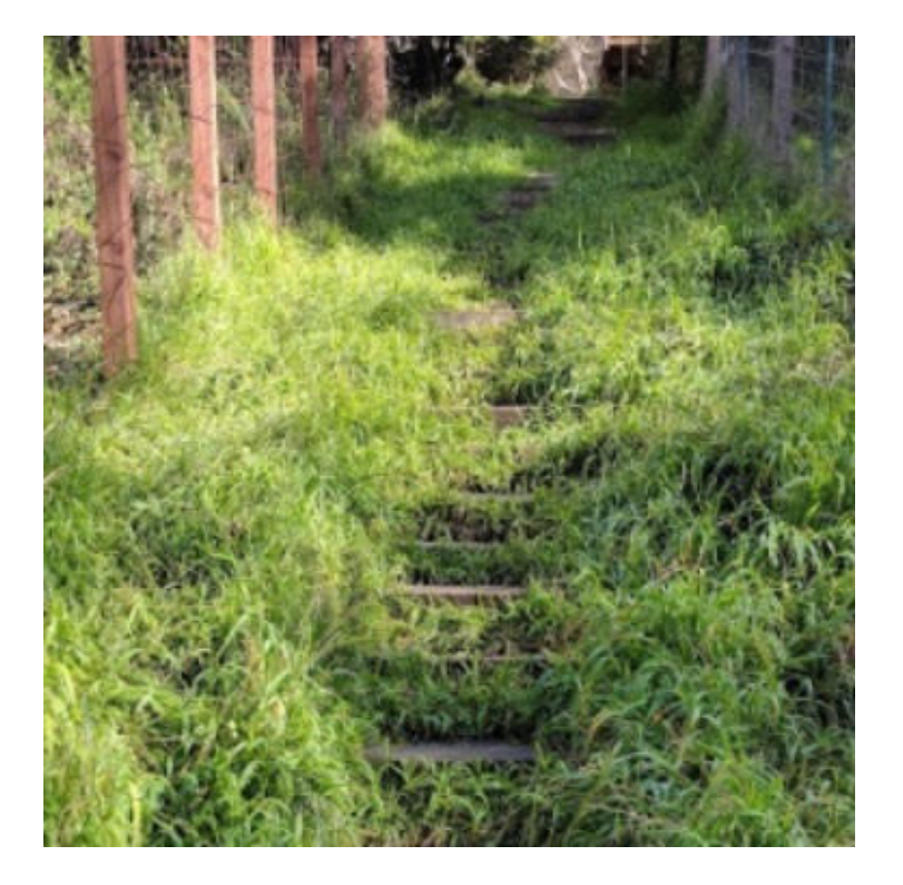
Weeds have taken over Poppy Path.