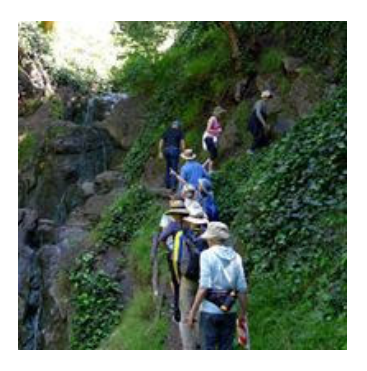
Your generosity enables us to build more paths and continue to offer our path-oriented events. Donate now.