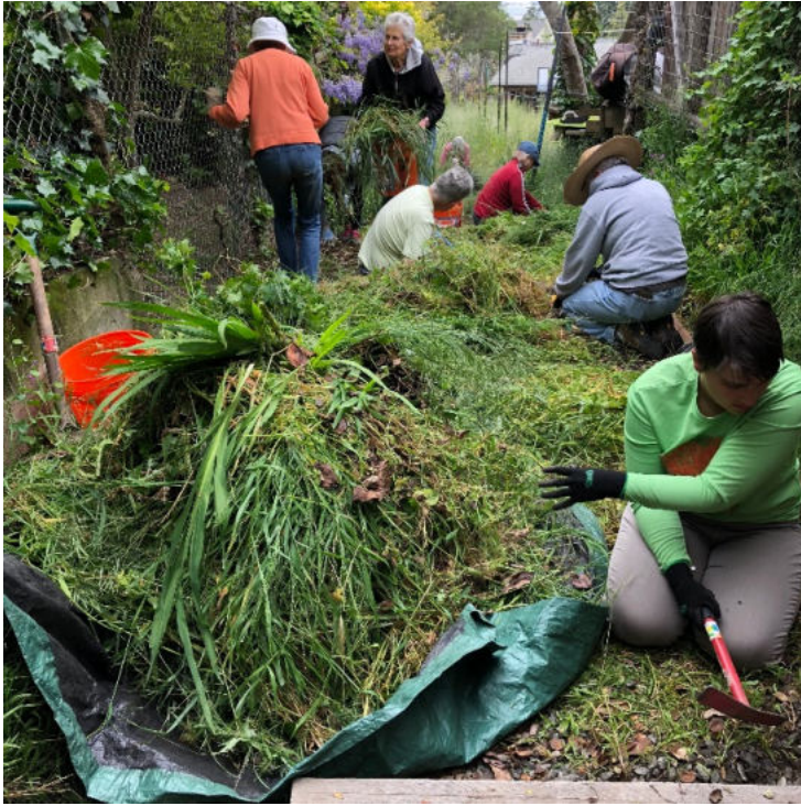
Intrepid volunteers spiffed up John Muir Path.