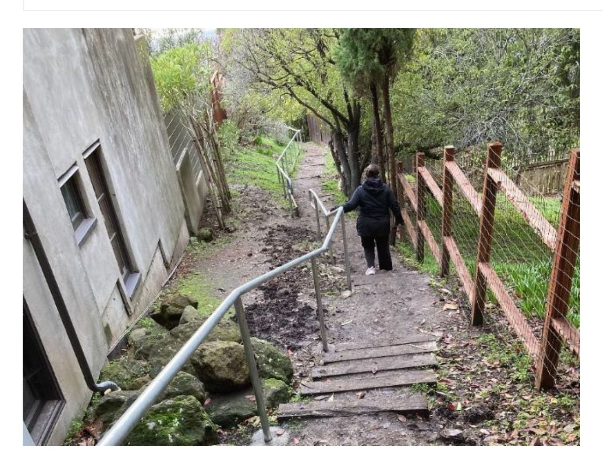
A happy path walker uses the new handrail on Middle Glendale Path.