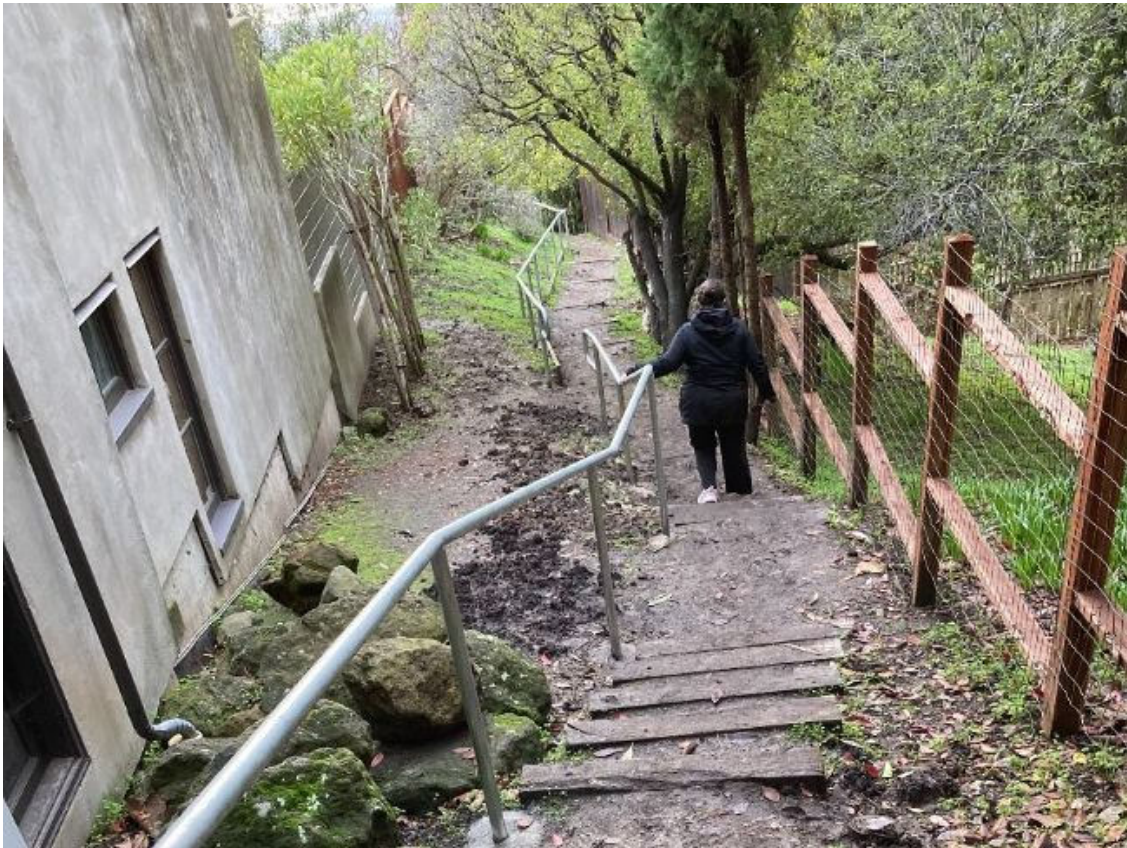
A happy path walker uses the new handrail on Middle Glendale Path.