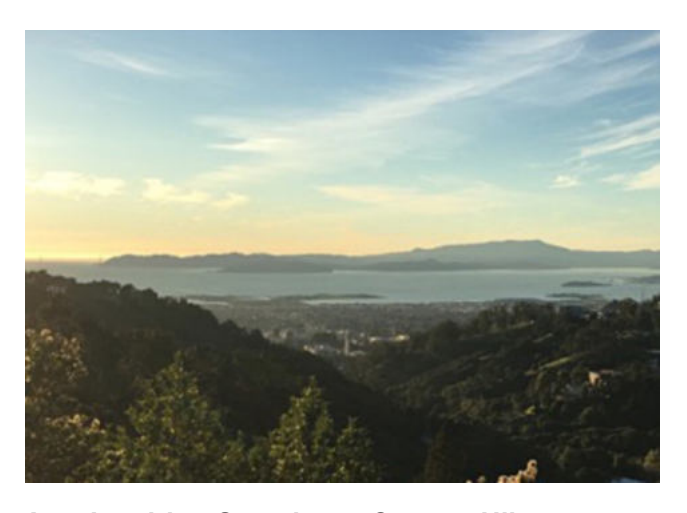
Awe-Inspiring Strawberry Canyon Hike