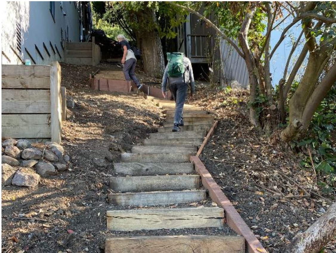
Lower Halkin Walk seeks walkers for New Year's adventures!

Berkeley's newest path, Lower Halkin Walk, is ready for exploration