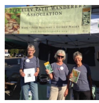
Berkeley Path Wanderers Association (BPWA) is a grassroots organization of people who treasure the public pathways that crisscross our city. Read more.

Our store will be open from 9:30 a.m. to 1:30 p.m. Although we prefer cash, we now accept credit cards. So come shop even if you can't do the Paths and Paths Challenge.