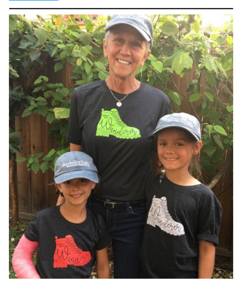
We don't sell our shirts online, so don't miss this chance to pick up yours at the Parks and Path Challenge.

You can save money by registering in advance for the Parks and Paths Challenge on <u>Eventbrite</u>. More details.