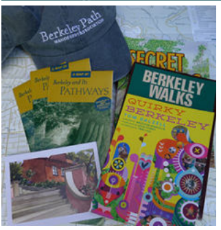
We sell Path Wanderer shirts, hats, and tote bags as well as guidebooks, posters, and note cards. Visit our store.