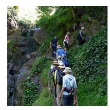
Your generosity enables us to build more paths and continue to offer our path-oriented events. Donate now.