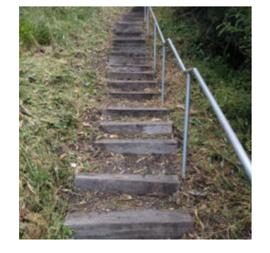
La Loma Path before weeding.