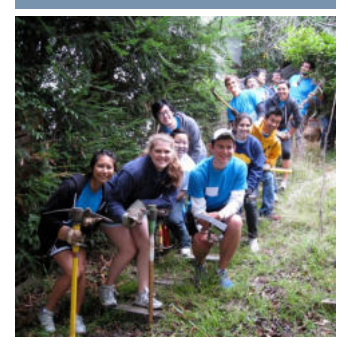
We need helping hands both on and off the paths. Discover how you can support our path building and enrich our programs and publicity. Sign up to help.