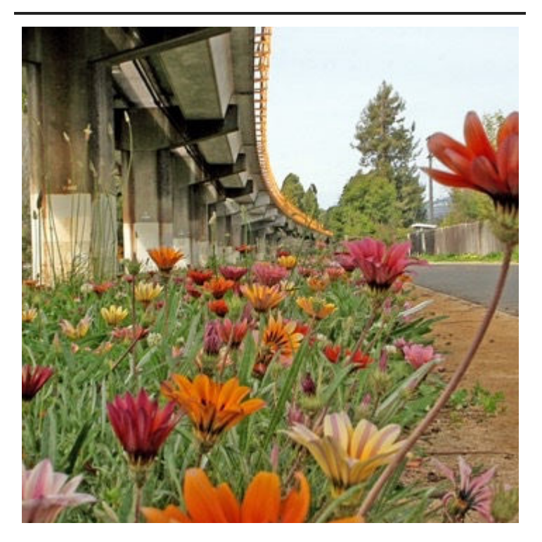
The Ohlone Greenway has many treats for the senses, both natural and manmade.

Here's your chance to get some exercise after work on this hike in the North Berkeley Hills, which will include some much-loved paths and parks. We'll do a 3.5-mile loop, starting with a climb from Solano to a block shy of Grizzly Peak Blvd., mostly on stairs and steep sidewalks. Our pace will be moderate, with stops to enjoy the views and conversation. We'll watch the sunset from one of the rock parks and be back to our start around 9 p.m. Bring water, a snack, and a flashlight or headlamp.