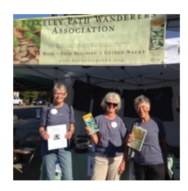
Berkeley Path Wanderers Association (BPWA) is a grassroots organization of people who treasure the public pathways that crisscross our city. Read more.

Join us on our terrific guided walks, which are free and open to all. Unless otherwise noted, they last 2-3 hours and proceed at a moderate, conversational pace. We're sorry, but we can't accommodate your dogs except on walks specified as dog friendly. Please check our home