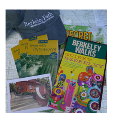
We sell Path Wanderer shirts, hats, and tote bags as well as guidebooks, posters, and note cards. Visit our store.