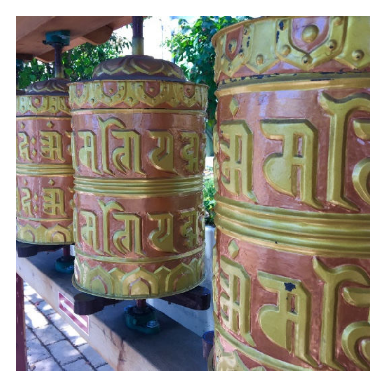
These Tibetan prayer wheels are just one of the interesting sights along this route.