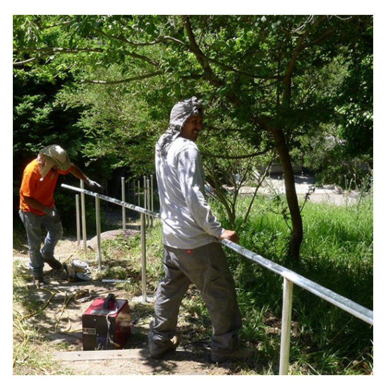
Work on the five-part handrail corridor began in May 2017 on upper Covert Path. The last two sections will be finished this month.