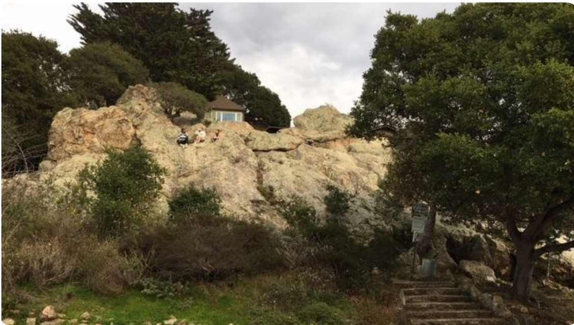
Grotto Rock Park is one of the 4 rock parks we'll visit on a 6- to 7-mile walk.

Pre-registration is required. E-mail Sandy with your child's name and age.