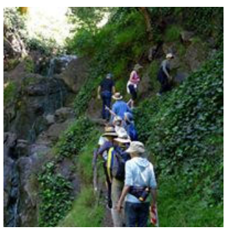
Your generosity enables us to build more paths and continue to offer our path-oriented events. Donate now.