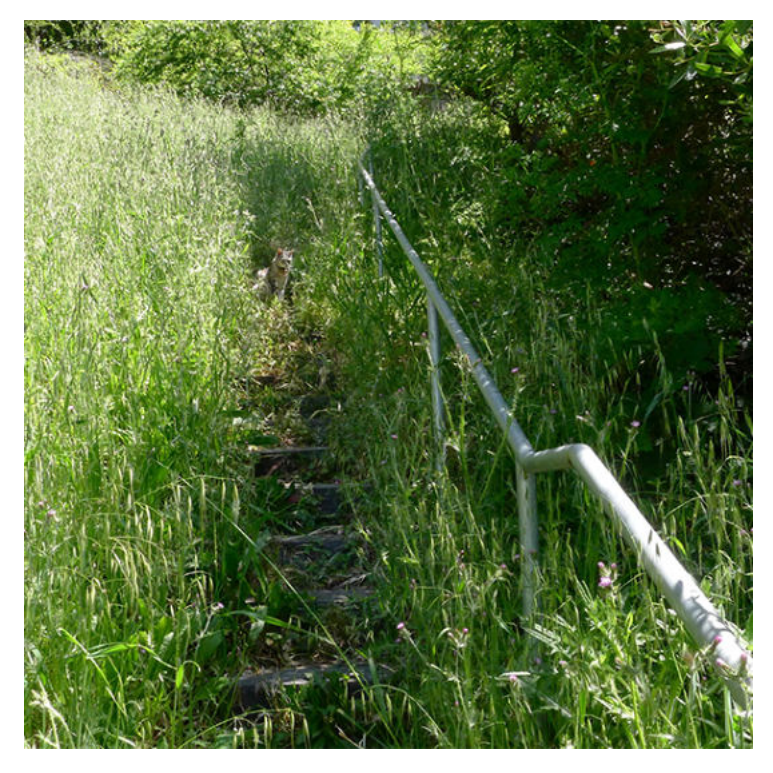
There's a handrail, so we know the steps must be somewhere in the weeds. But can you spot the cat?