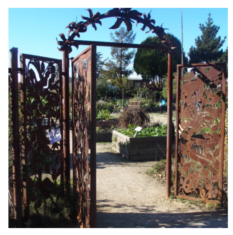
A stop at the Peralta Community Gardens will provide lots of sensory pleasures.