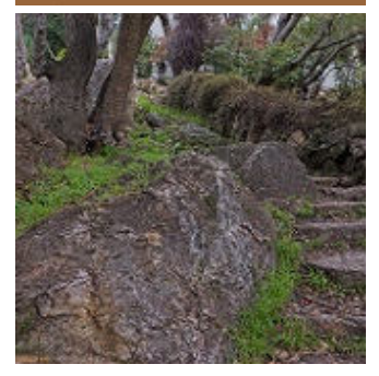
Did you forget to pay your $5 dues for 2017? We do not want to lose you. <u>Please</u> renew today.