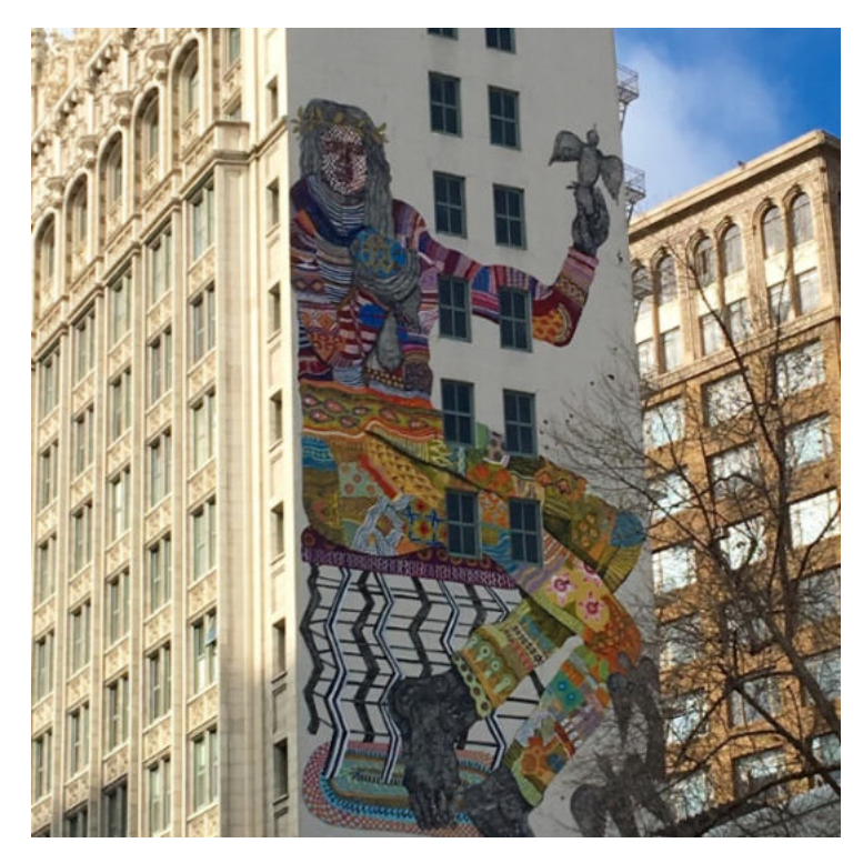
This 135-foot tall mural, "A Bird in Hand," graces the Cathedral Building at Telegraph and Broadway and commemorates the 70th anniversary of the United Nations.