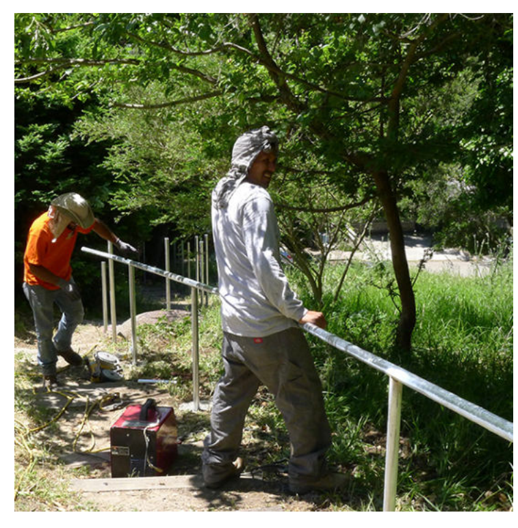
Workers completed the new handrails in mid-May.