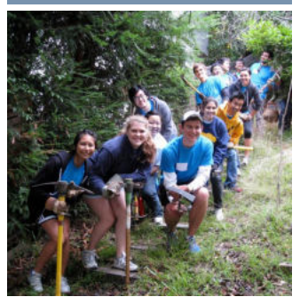
We need helping hands both on and off the paths. Discover how you can support our path building and enrich our programs and publicity. <u>Sign up to help.</u>