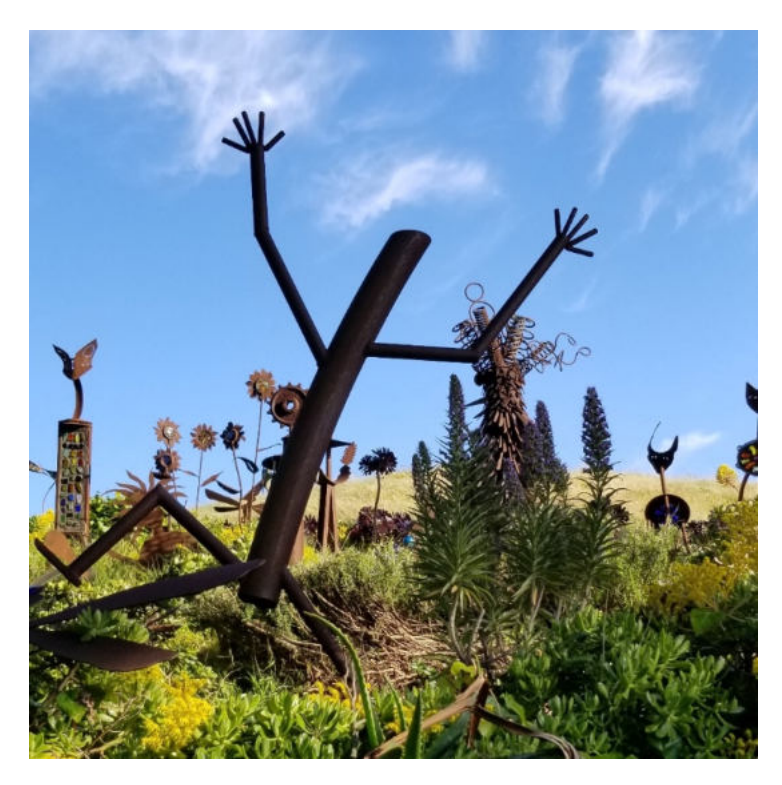
Other-worldly creatures will welcome us near the Castro Duncan Open Space, the smallest of the five parks on this walk.