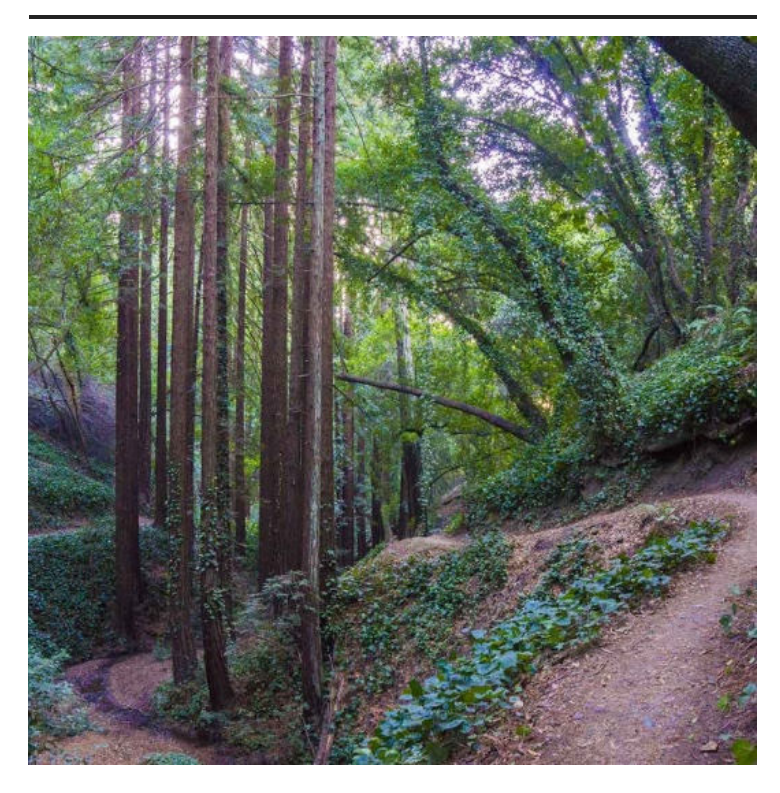
With its extensive second-growth redwood groves, Joaquin Miller Park is one of the best examples of the Oakland Hills' surprisingly lush landscapes.

Join us on our terrific guided walks, which are free and open to all. Unless otherwise noted, they last 2-3 hours and proceed at a moderate, conversational pace. We're sorry, but we can't accommodate your dogs except on walks specified as dog friendly. Please check our <u>home</u> <u>page</u> for last-minute weather cancellations. Questions about a walk? Write <u>walks@berkeleypaths.org</u>