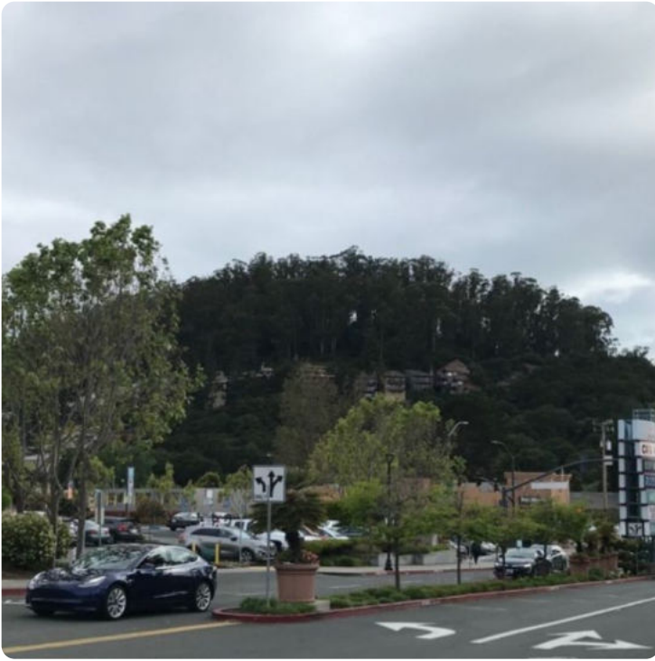
Albany Hill from El Cerrito Plaza.