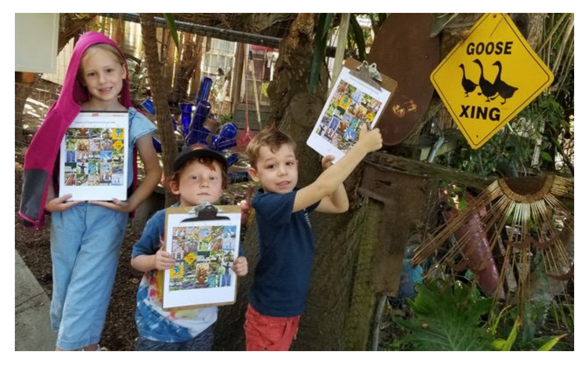
Each child will get a Bingo card with 25 pictures. The cards have the same pictures but in different order.