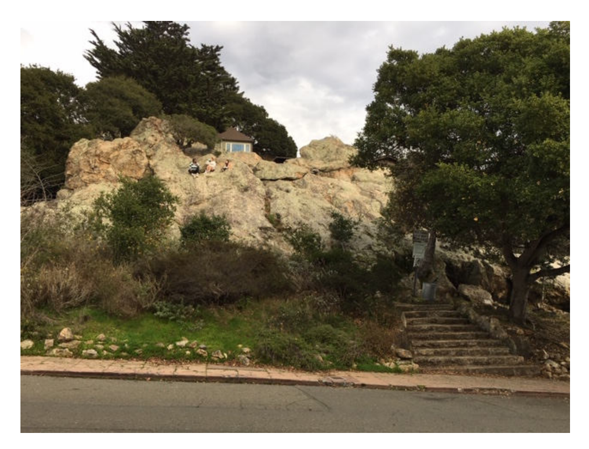
Grotto Rock Park is one of the 4 rock parks we'll visit on a 6- to 7-mile walk.