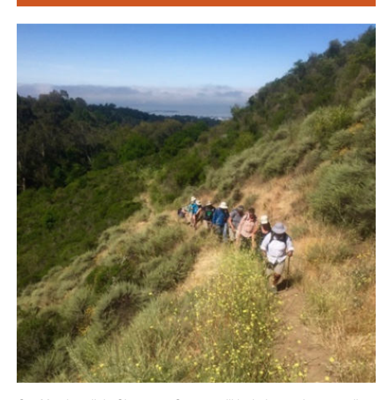
Our March walk in Claremont Canyon will include scenic new trails.