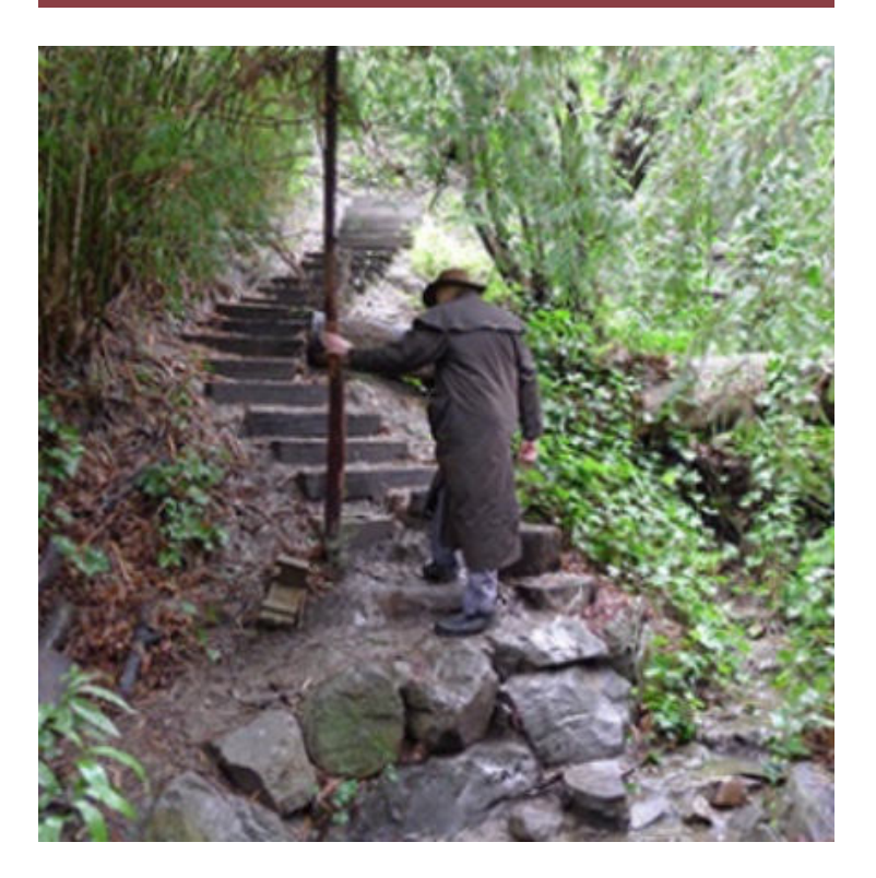
The lower half of Covert Path is one the most beautiful paths.