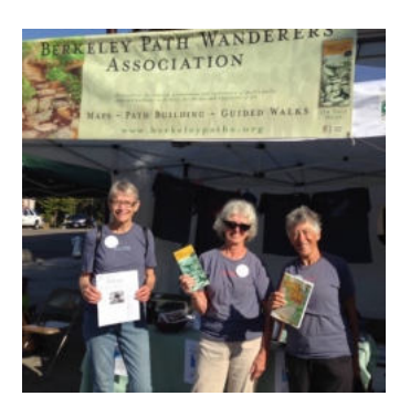
Berkeley Path Wanderers Association (BPWA) is a grassroots organization of people who treasure the public pathways that crisscross our city. Read more.

You'll find links to many other organizations that promote walking, pedestrian safety, preserving Berkeley's heritage, protecting the environment, and more on our website.