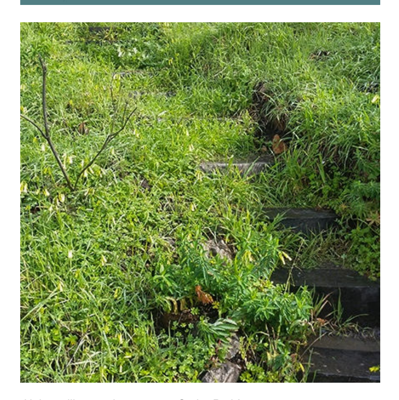
Help us liberate the steps on Cedar Path!