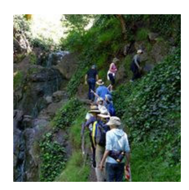
Your generosity enables us to build more paths and continue to offer our path-oriented events. <u>Donate now.</u>