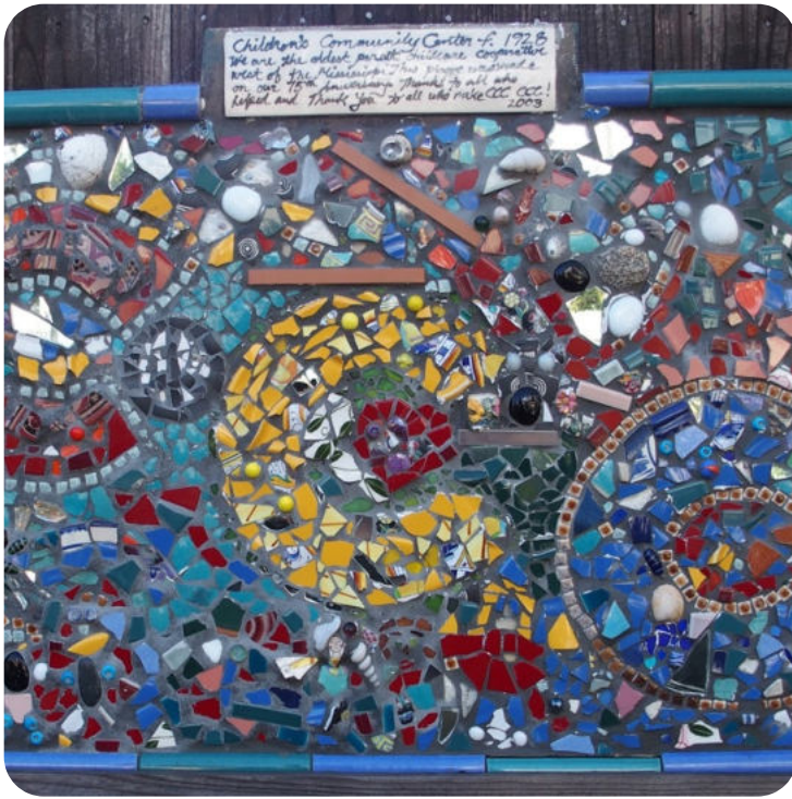
Mosaic at the Children's Community Center preschool on Walnut St.