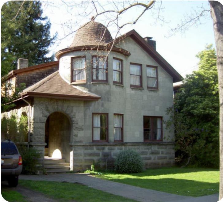
The Willard neighborhood walk includes this stone house on Piedmont Ave. near Parker St.

Join us on our terrific guided walks, which are free and open to all. Unless otherwise noted, they last 2 to 3 hours and proceed at a moderate, conversational pace. We’re sorry, but we can’t accommodate your dogs except on walks specified as dog-friendly. Please check our home page for last-minute weather cancellations. Questions about a walk? Write walks@berkeleypaths.org .