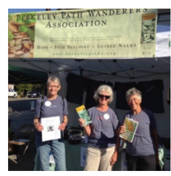
Berkeley Path Wanderers Association (BPWA) is a grassroots organization of people who treasure the public pathways that crisscross our city. Read more.