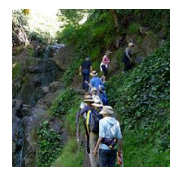
Your generosity enables us to build more paths and continue to offer our path-oriented events. Donate now.

The shirts are a fashionable charcoal gray with either light