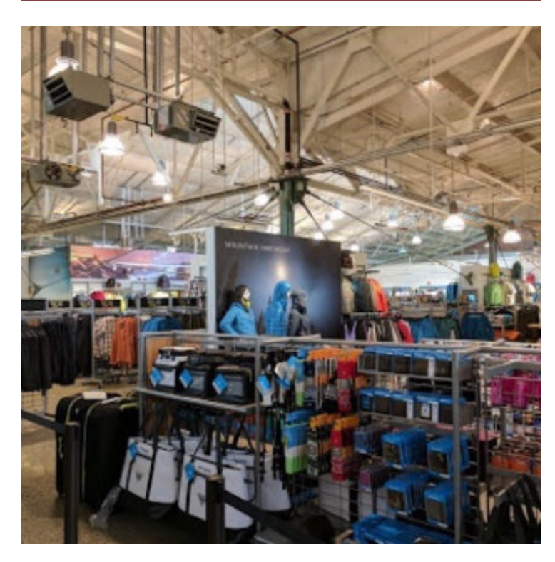
Your $5 membership to BPWA earns you a pass to the Mountain Hardware Employee Store, where you can save 40% - 50% off your favorite brands.