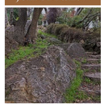
Did you forget to pay your $5 dues for 2017? Don't miss your chance to shop at the Mountain Hardware Employee Store. Please renew today.