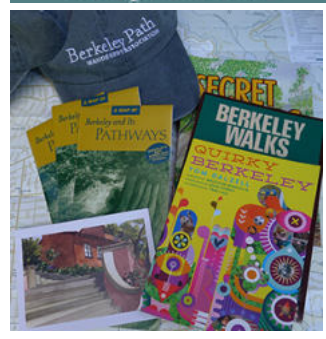
We sell Path Wanderer shirts, hats, and tote bags as well as guidebooks, posters, and note cards. <u>Visit our store</u>.