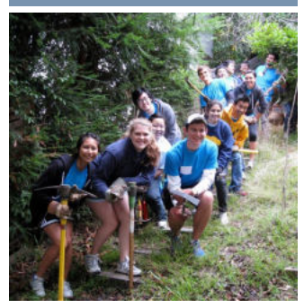
We need helping hands both on and off the paths. Discover how you can support our path building and enrich our programs and publicity. Sign up to help.