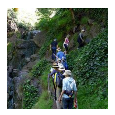
Your generosity enables us to build more paths and continue to offer our path-oriented events. <u>Donate now.</u>