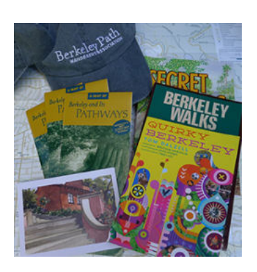
We sell Path Wanderer shirts, hats, and tote bags as well as guidebooks, posters, and note cards. Visit our store.