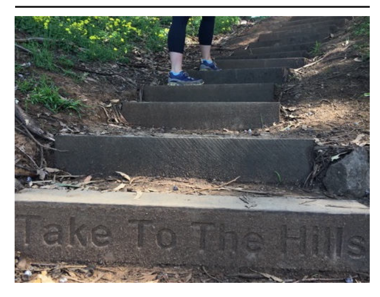
The first step of the improved Clark Kerr Trail encourages hikers to, well, head up — and up and up!

will be Tuesday, May 1, at 6 p.m. at the City Council Chambers at 2134 Martin Luther King Jr. Way. Join us afterward for a celebratory beer at Spats (1974 Shattuck). Show your support by proudly wearing your BPWA hat and tee shirt!