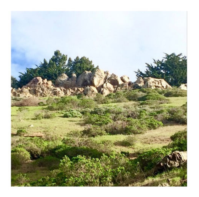
Outcrops of Franciscan chert are among the interesting features of 70-acre Glen Canyon.