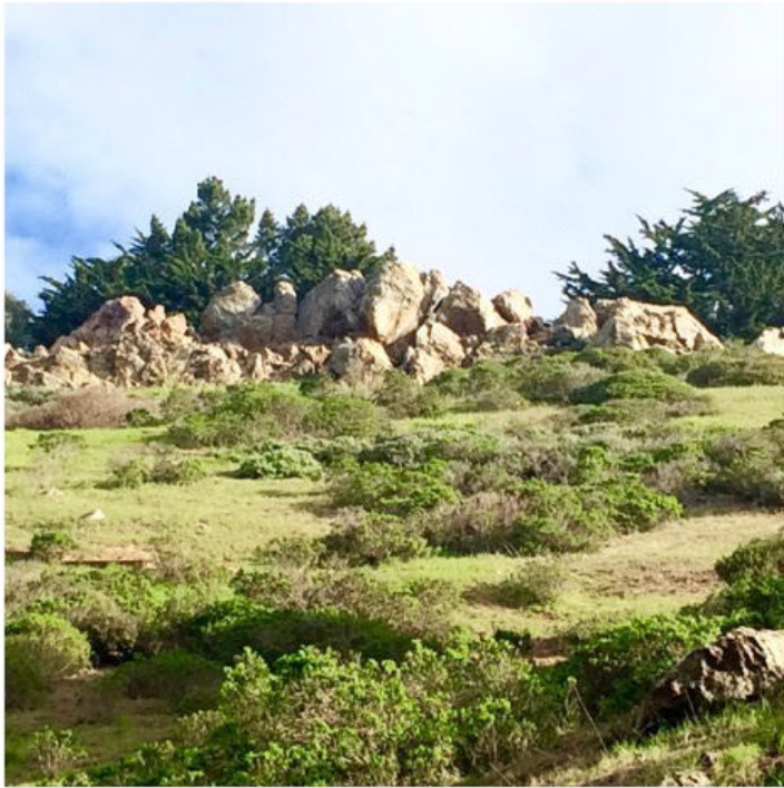
Outcrops of Franciscan chert are among the interesting features of 70-acre Glen Canyon.