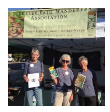
Berkeley Path Wanderers Association (BPWA) is a grassroots organization of people who treasure the public pathways that crisscross our city. Read more.

Our 20th anniversary celebration continues! We're planning a family-friendly, path-oriented event Sunday, July 22, in the morning. Mark your calendars, and watch for details in our June e-newsletter.