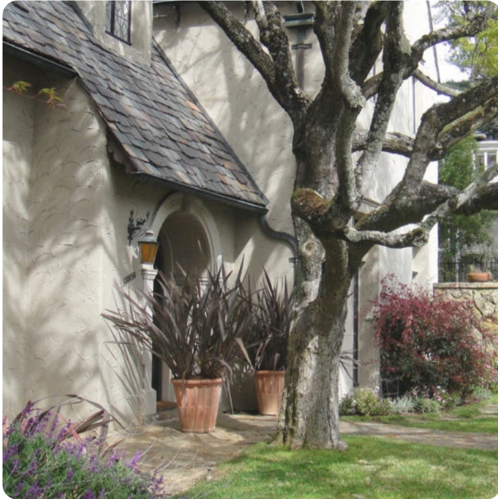
Claremont Court was designed as Berkeley's own version of Pacific Heights.

Columbia Path is in the Terrace View neighborhood. If you'd like to support our efforts to expand the path network in this part of Berkeley, please donate and spread the word about the ongoing GoFundMe fundraising campaign . Thank you to all those who have already donated! You are making a difference.