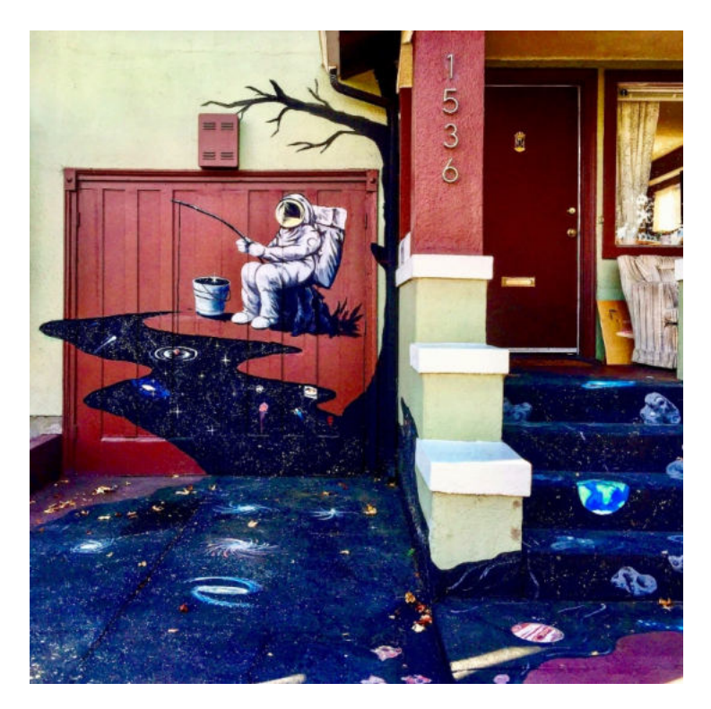
By the time we see him, perhaps this interplanetary angler will have landed a star fish.