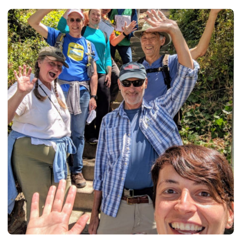
Path Wanderers volunteers have the MOST fun!!! Join us!