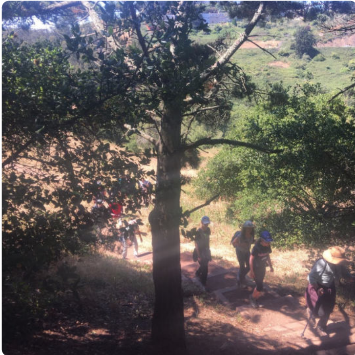
Glen Park Canyon is just a short walk from the Glen Park BART station in southern San Francisco.

Calling all early birds! Bring your flashlight, an extra layer, and breakfast for a 4.5-mile, out-and-back sunrise hike from Inspiration Point to Wildcat Peak in Tilden Park. We will start in the dark and walk along the Nimitz Way trail as dawn breaks over the East Bay hills. The trail is mostly flat and paved, with a short but somewhat steep 0.25 mile climb on a dirt trail up to Wildcat Peak. At the top we will take some time to enjoy breakfast as we watch the sunrise and take in sweeping views of the hills, San Francisco, and the North Bay. Rain cancels; if in doubt, please check the BPWA website the night before the hike for an update.