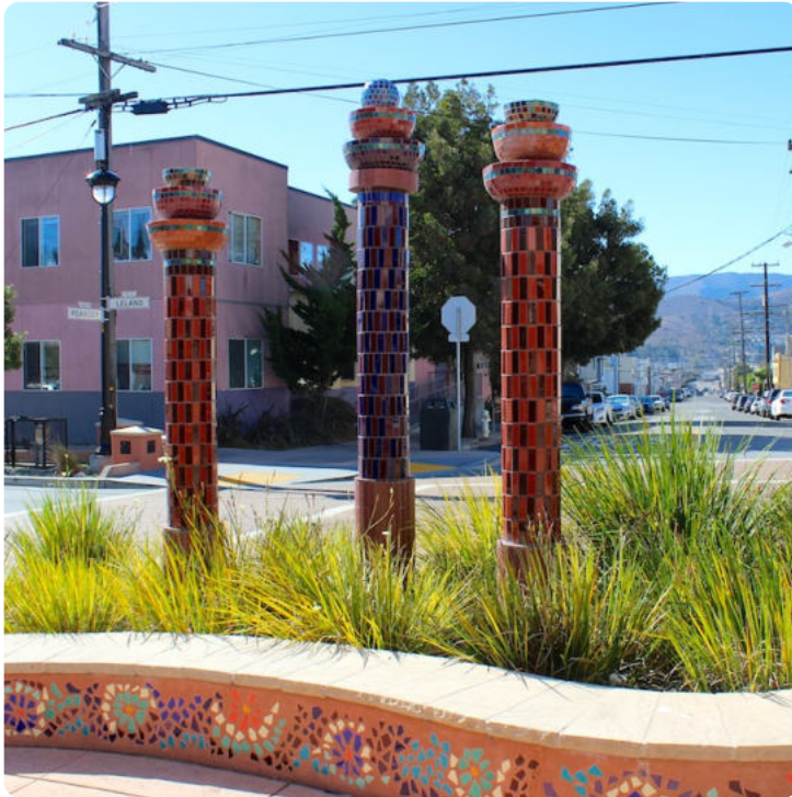
On the last leg of San Francisco's Crosstown Trail, we explore Visitation Valley (shown) and John McLaren Park.