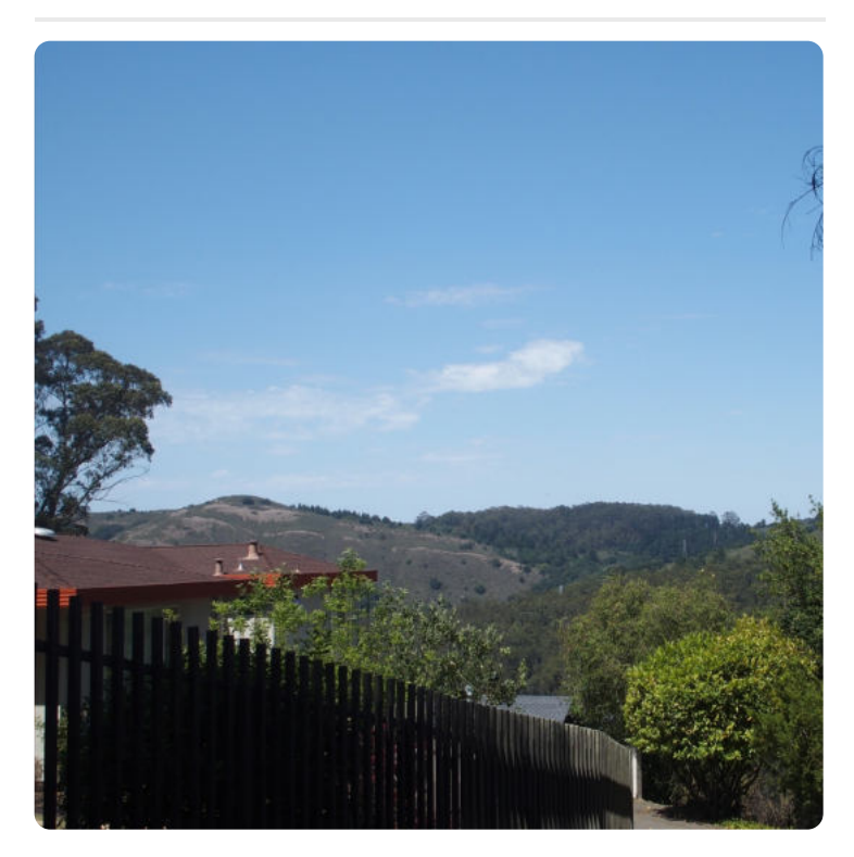
A view of Tilden Park from Vistamont Avenue in the Berkeley Woods.

Save-the-date for the final hike in the series: Sunday, Dec. 15.