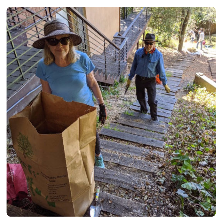
Path Wanderers volunteers weed on Bret Harte Path.