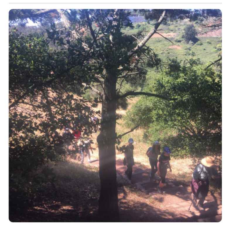
Glen Park Canyon is just a short walk from the Glen Park BART station in southern San Francisco.

Calling all early birds! Bring your flashlight, an extra layer, and breakfast for a 4.5-mile, out-and-back sunrise hike from Inspiration Point to Wildcat Peak in Tilden Park. We will start in the dark and walk along the Nimitz Way trail as dawn breaks over the East Bay hills. The trail is mostly flat and paved, with a short but somewhat steep 0.25 mile climb on a dirt trail up to Wildcat Peak. At the top we will take some time to enjoy breakfast as we watch the sunrise and take in sweeping views of the hills, San Francisco, and the North Bay. Rain cancels; if in doubt, please check the BPWA website the night before the hike for an update.