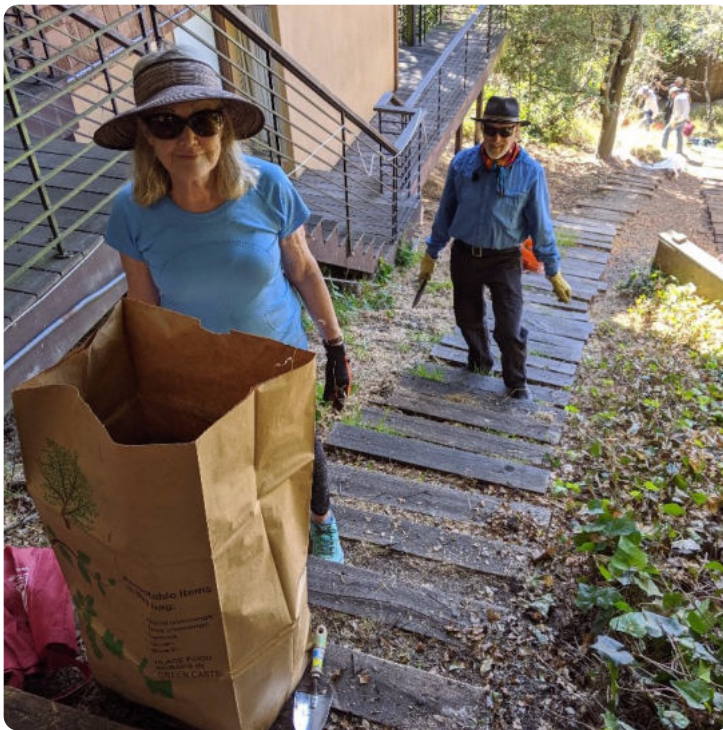
Path Wanderers volunteers weed on Bret Harte Path.