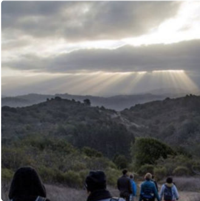
Sunrise at Wildcat Peak.

Join us on our terrific guided walks, which are free and open to all. Unless otherwise noted, they last 2 to 3 hours and proceed at a moderate, conversational pace. We're sorry, but we can't accommodate your dogs except on walks specified as dog-friendly. Please check our home page for last-minute weather cancellations. Questions about a walk? Write walks@berkeleypaths.org .