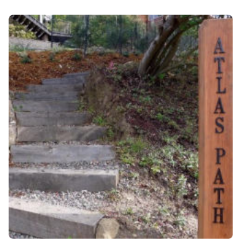
Your generosity enables us to build more paths and continue