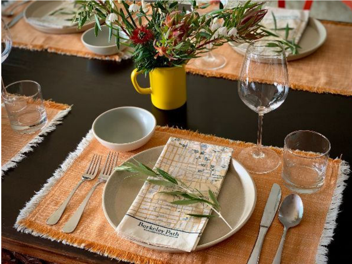
BPWA member Jen Bilik's Thanksgiving table features our new paths bandana