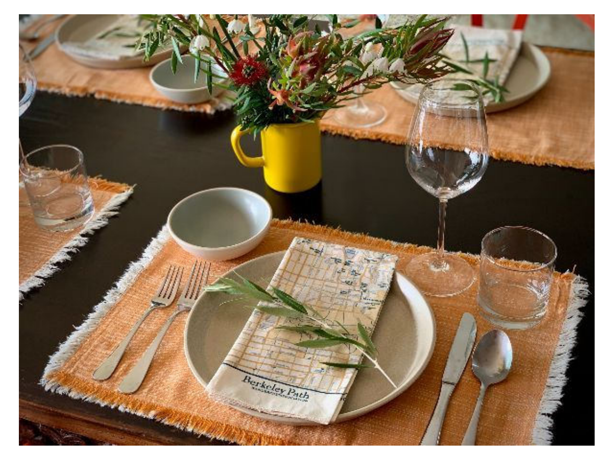
BPWA member Jen Bilik's Thanksgiving table features our paths bandana