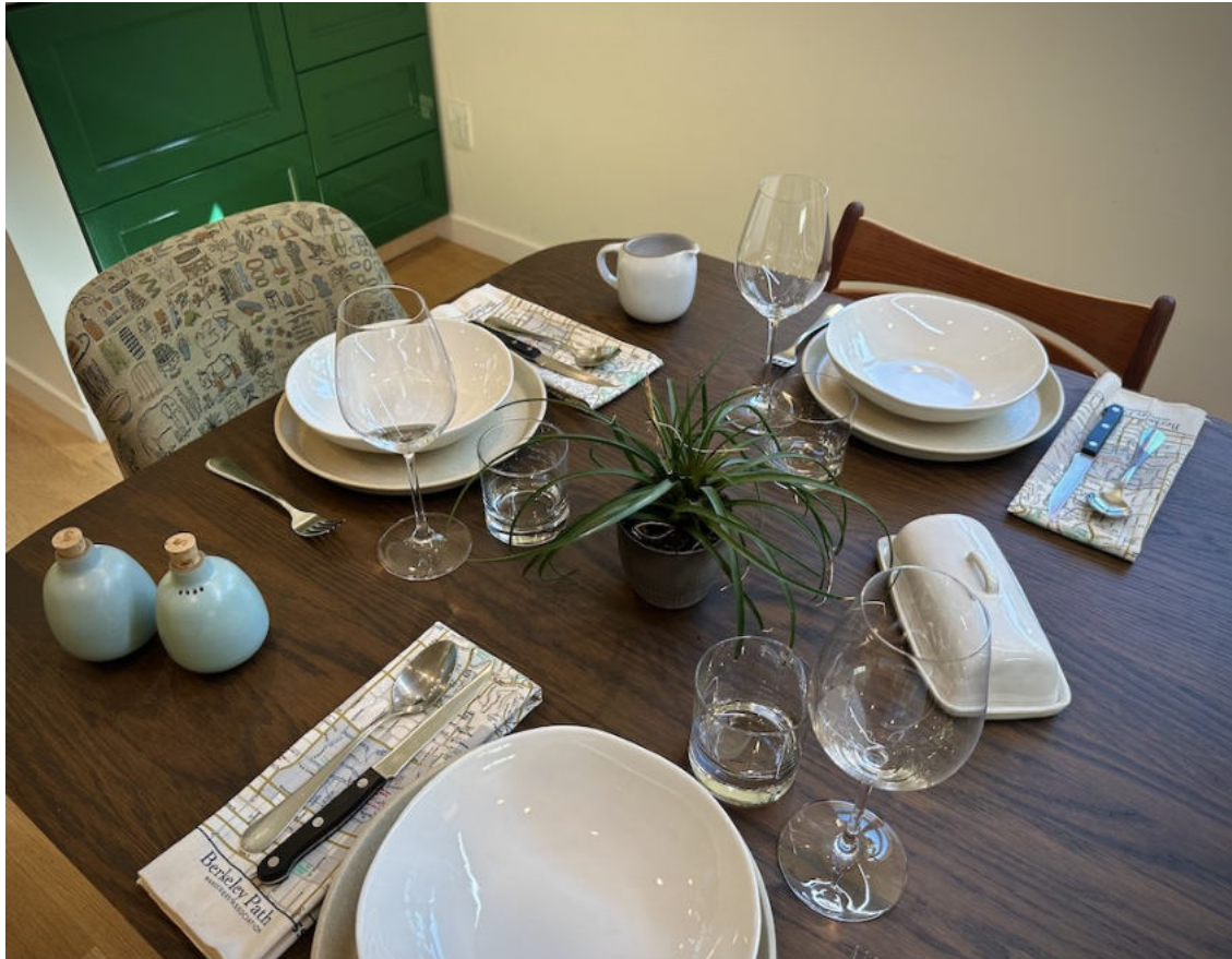
The cotton bandanas can do double-time as cloth napkins for your Thanksgiving table!