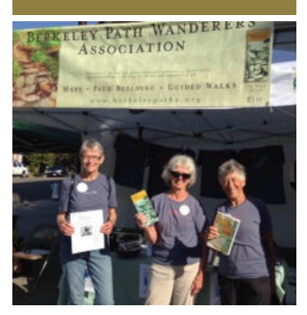
Berkeley Path Wanderers Association (BPWA) is a grassroots organization of people who treasure the public pathways that crisscross our city. Read more.