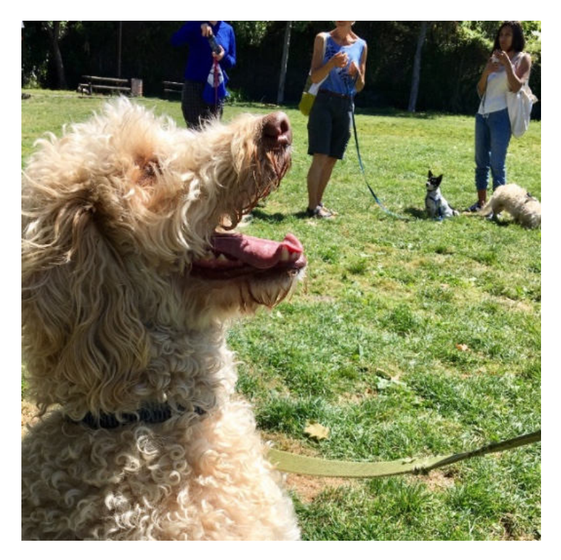
How do we love our dogs, like Chester here? We'll count the ways on this walk for pooches and people.