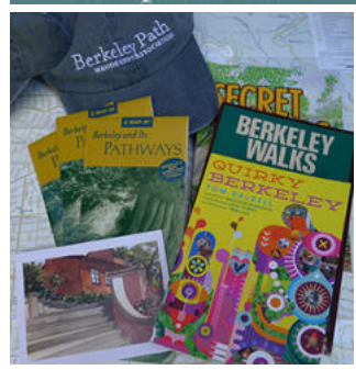
We sell Path Wanderer shirts, hats, and tote bags as well as guidebooks, posters, and note cards. Visit our store.