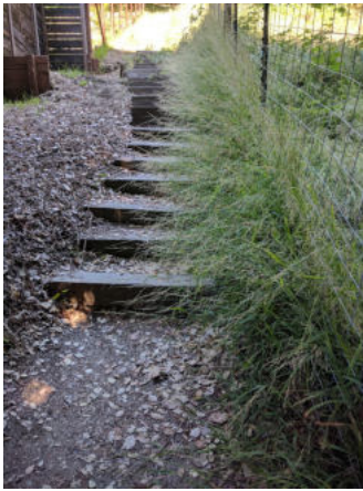
Poppy path before weeding.