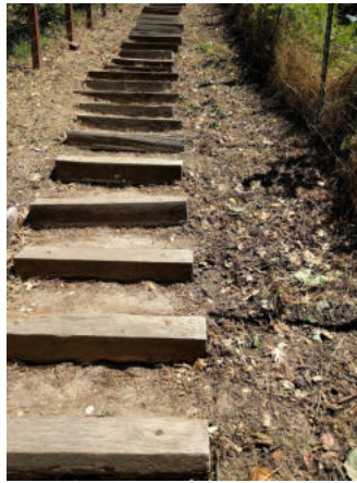
Poppy Path after weeding.