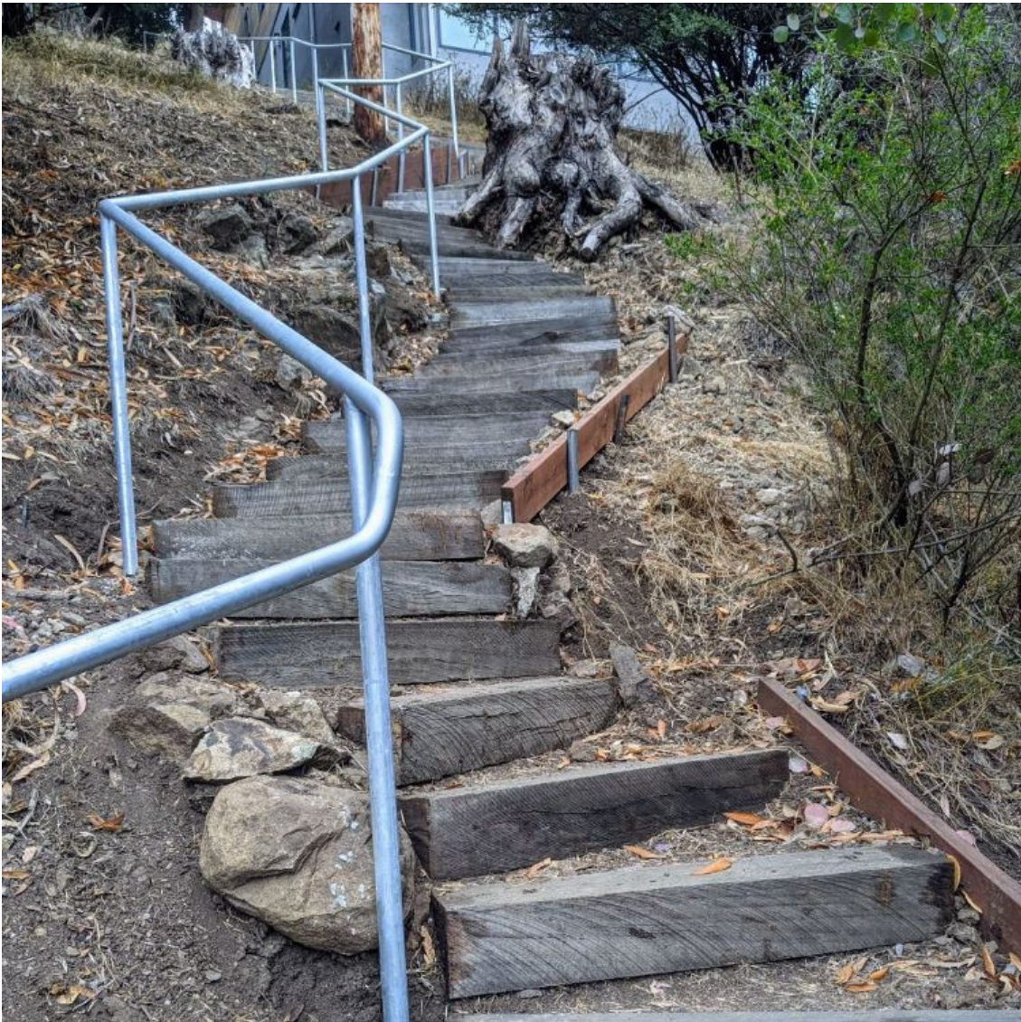
Above, the new handrail installed by Berkeley Path Wanderers Association on Columbia Path.