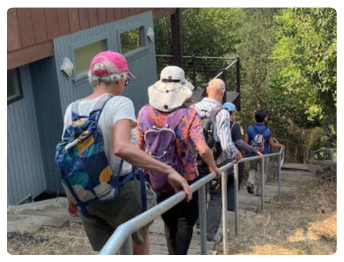
BPWA board members use the new handrail on Lower Halkin Walk.

Adding handrails to steep paths: A BPWA priority