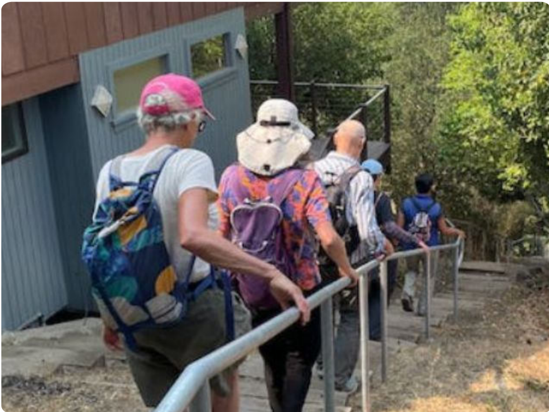
BPWA board members use the new handrail on Lower Halkin Walk.

Adding handrails to steep paths: A BPWA priority