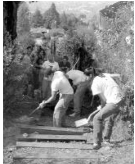
University of California, Berkeley students install steps on Atlas Path as part of Cal Corps, October 20th public-service day.

Fountain Walk Of course, we all know the Fountain at the Marin Circle is standing pretty. See Spring '99, Vol. 2 No.2 for story about its restoration.