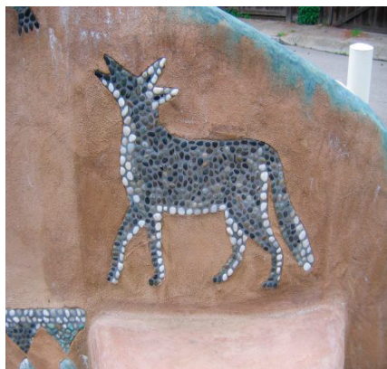
Ohlone Greenway Artwork