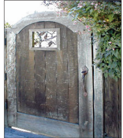
Gate on Alvarado Road