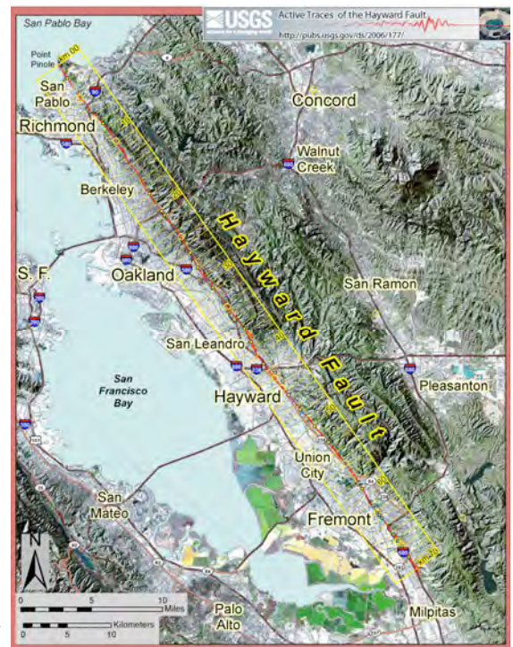
Hayward Fault Expert to Give Keynote Speech